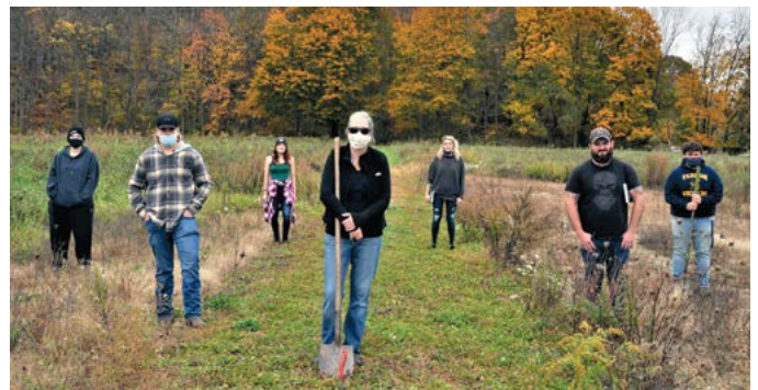
Sussex County Community College on SAGe

A goat, chicken and vegetable farm whose owner brings his farming experience from his family farm in Nepal.