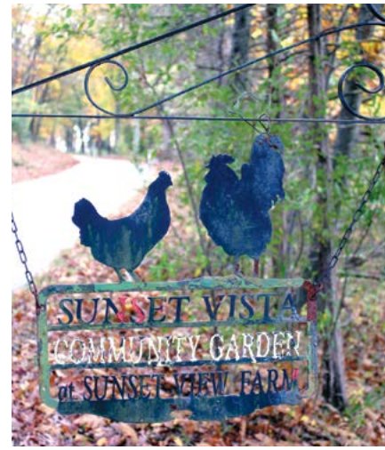
Sunset View Farms

289 US-206, Andover Twp., NJ 07860 973.362.8273 newtonosb.org/2020-christmas-tree-map-information The relationship between St. Paul's Abbey and Christmas trees goes back to the founding of the monastery in 1924. Since 2009, the Brothers have been using organic farming methods. Trees are offered after Thanksgiving.