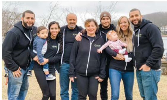
The Yassin family of Green Life Market