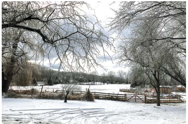
Brickyard Farm in winter