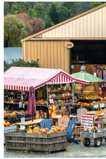
Sussex County Strawberry Farm