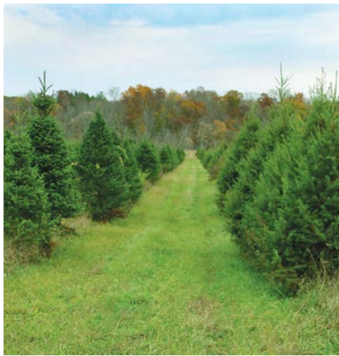
St. Paul's Abbey Christmas Tree Farm