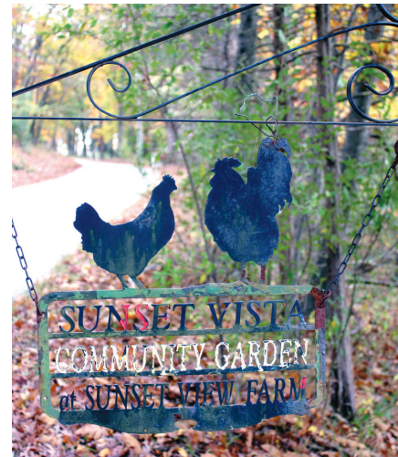
Sunset View Farms

289 US-206, Andover Twp., NJ 07860 973.362.8273 newtonsb.org/2020-christmas-tree-map-information The relationship between St. Paul's Abbey and Christmas trees goes back to the founding of the monastery in 1924. Since 2009, the Brothers have been using organic farming methods. Trees are offered after Thanksgiving.