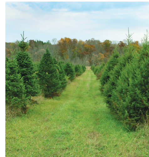
St. Paul's Abbey Christmas Tree Farm