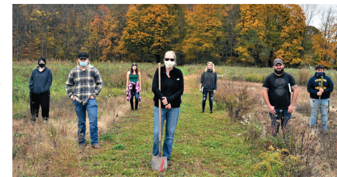
Sussex County Community College on SAGe

USA Agro Farm usaagrofarm@gmail.com A goat, chicken and vegetable farm whose owner brings his farming experience from his family farm in Nepal.