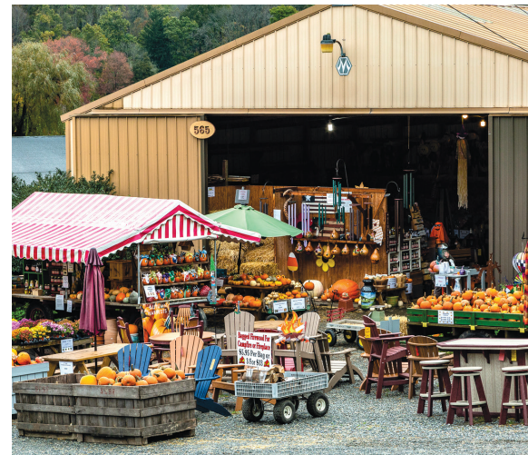
Sussex County Strawberry Farm