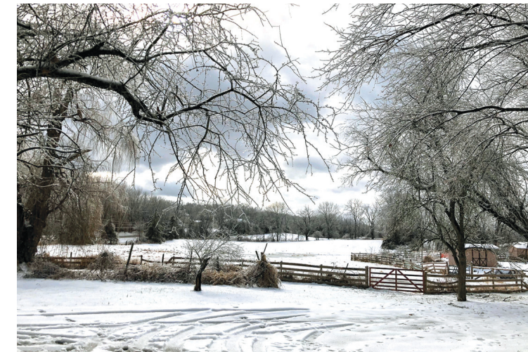
Brickyard Farm in winter