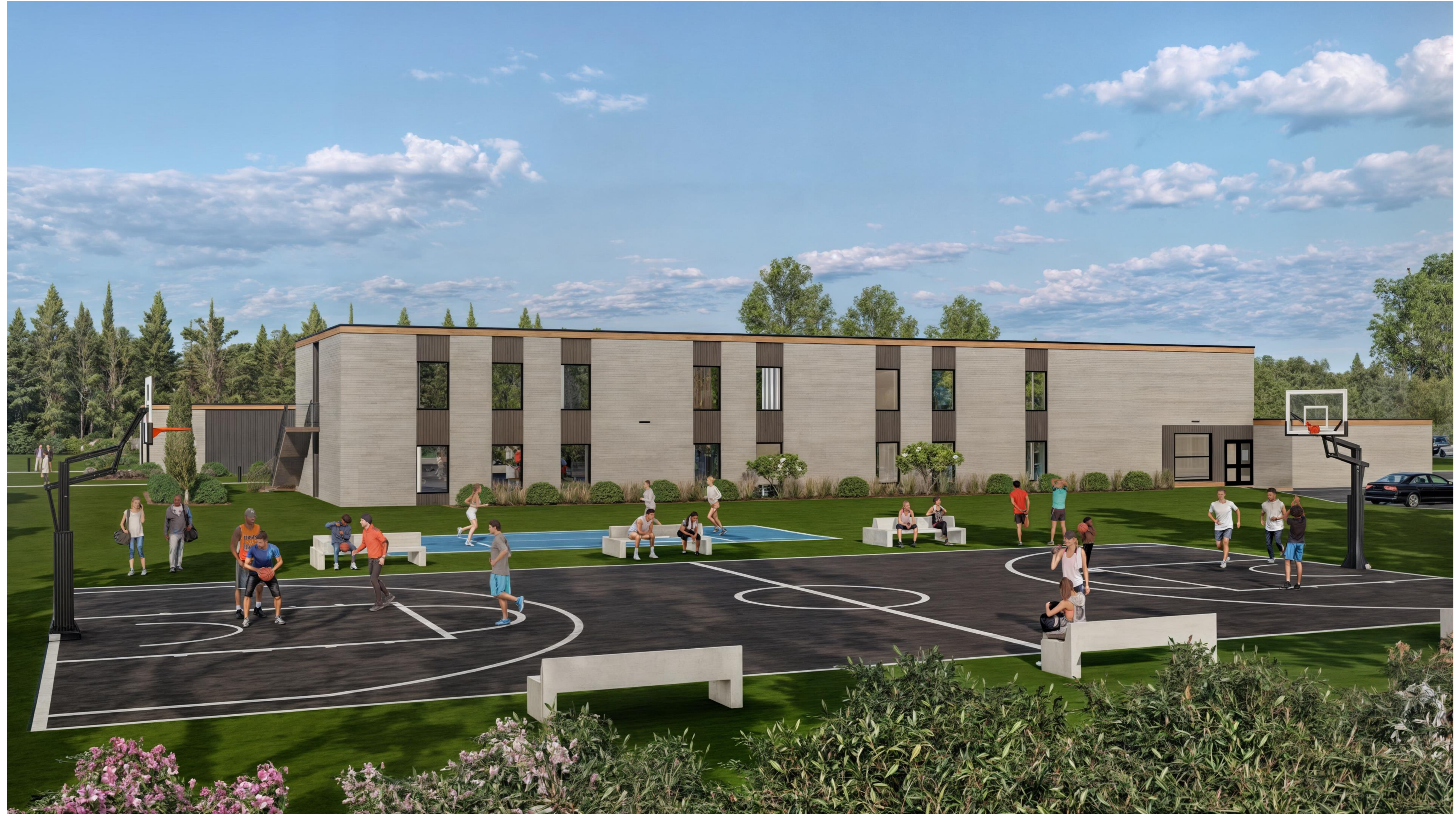
BASKETBALL COURT VIEW