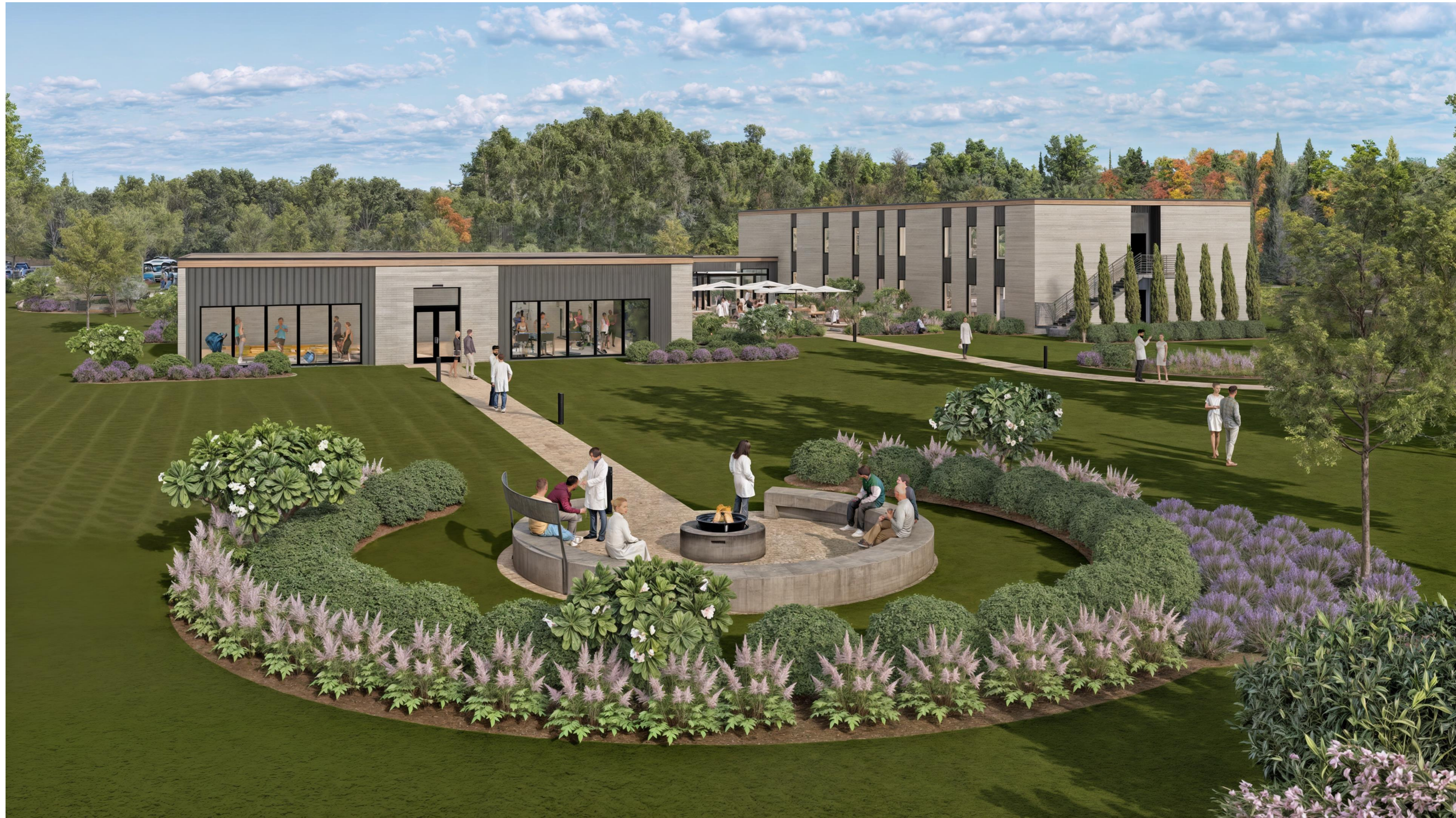
FIRE PIT GATHERING SPACE'S VIEW