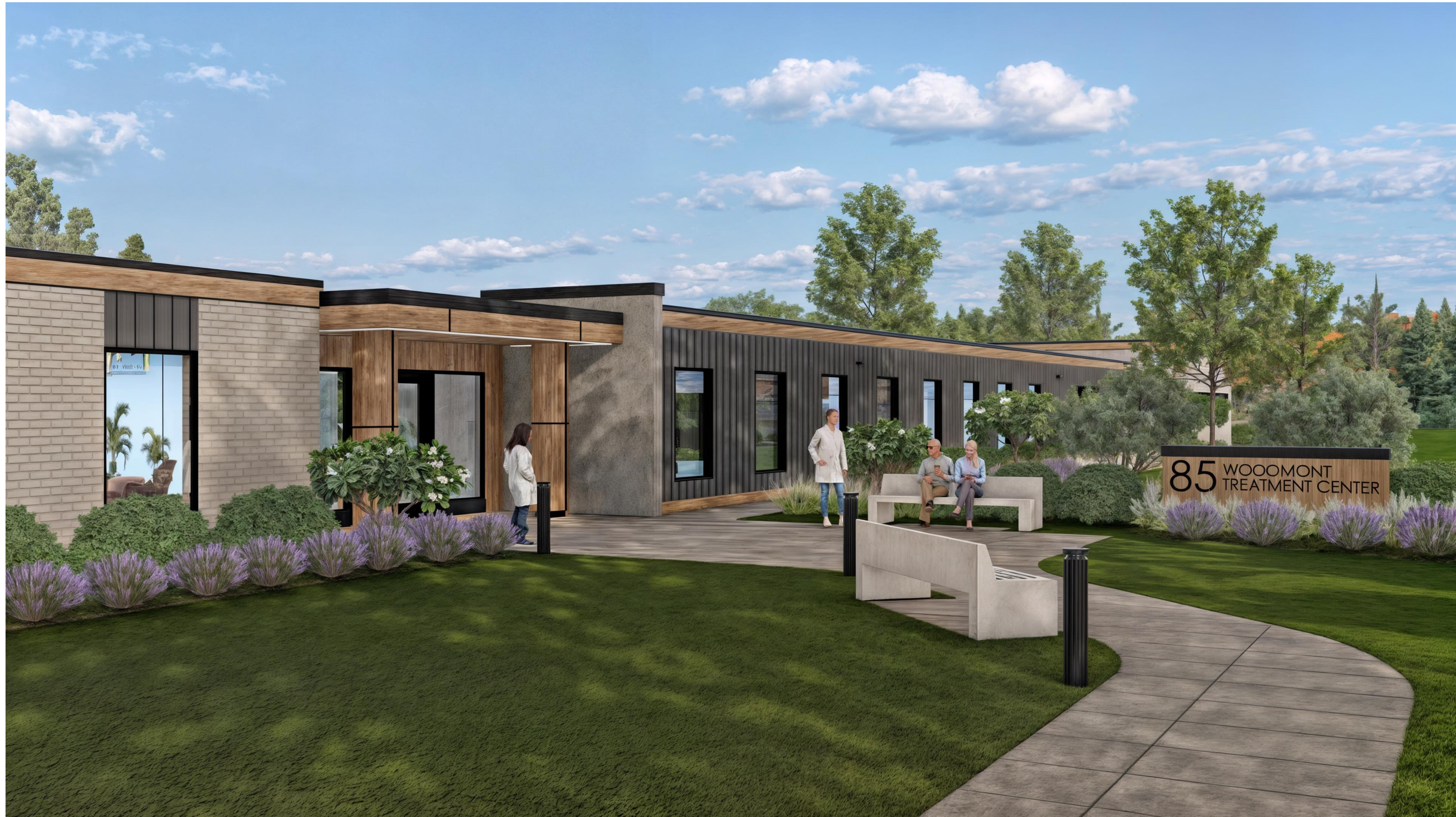
MAIN ENTRANCE VIEW