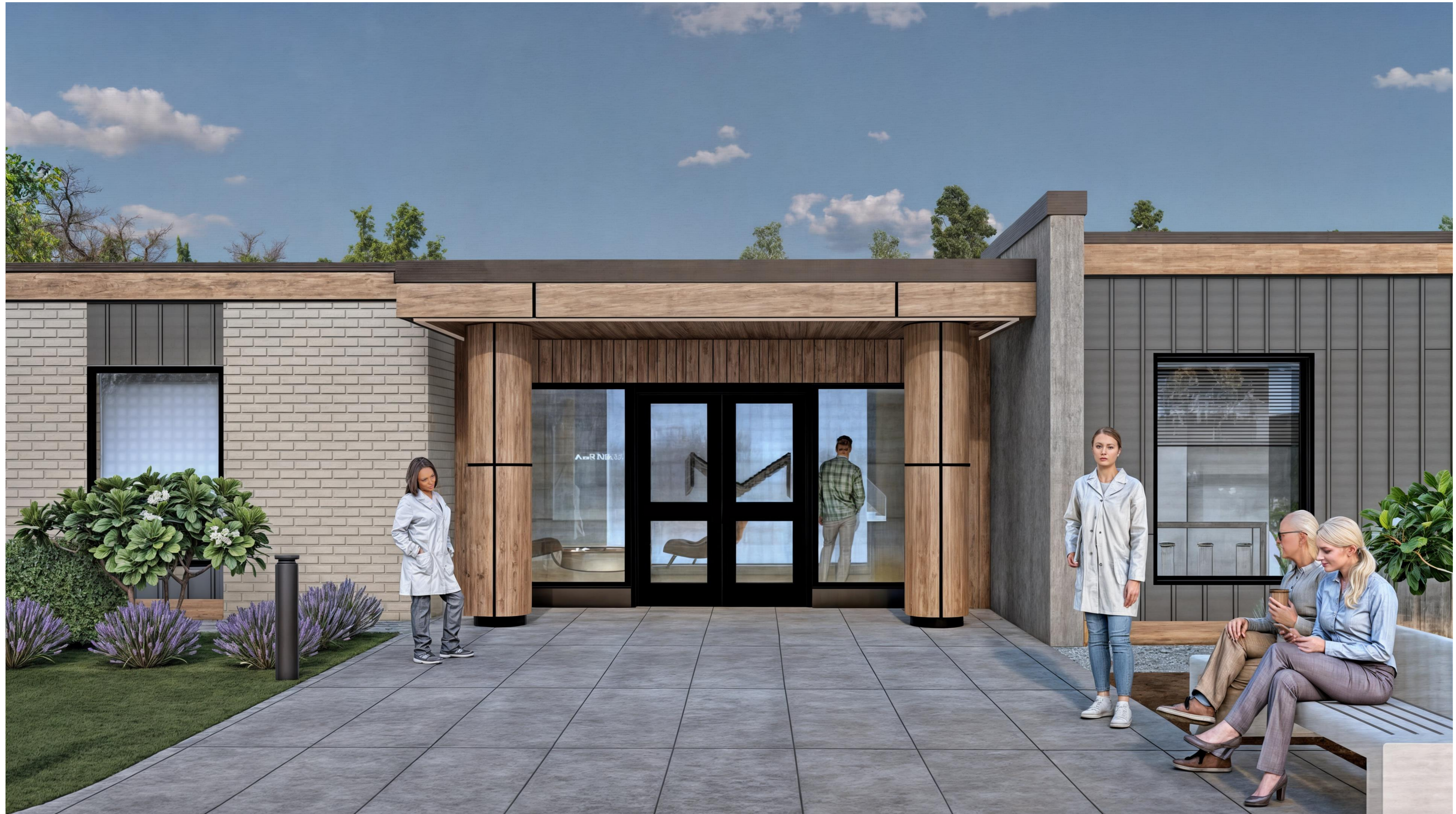
MAIN ENTRANCE VIEW