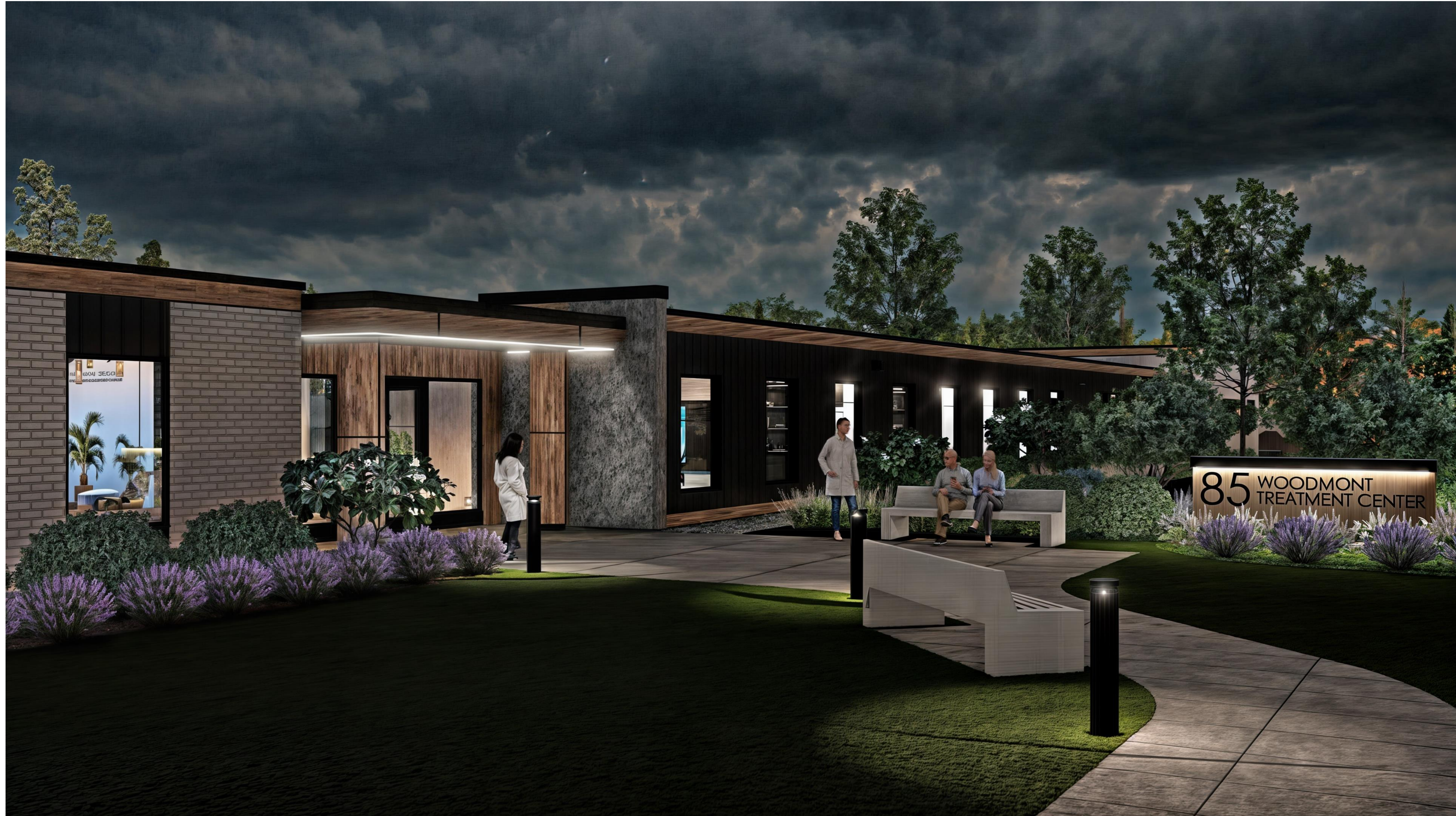
MAIN ENTRANCE VIEW