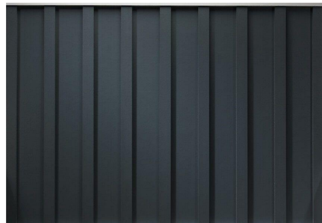
BATTEN BOARDS BY JAMES HARDIE