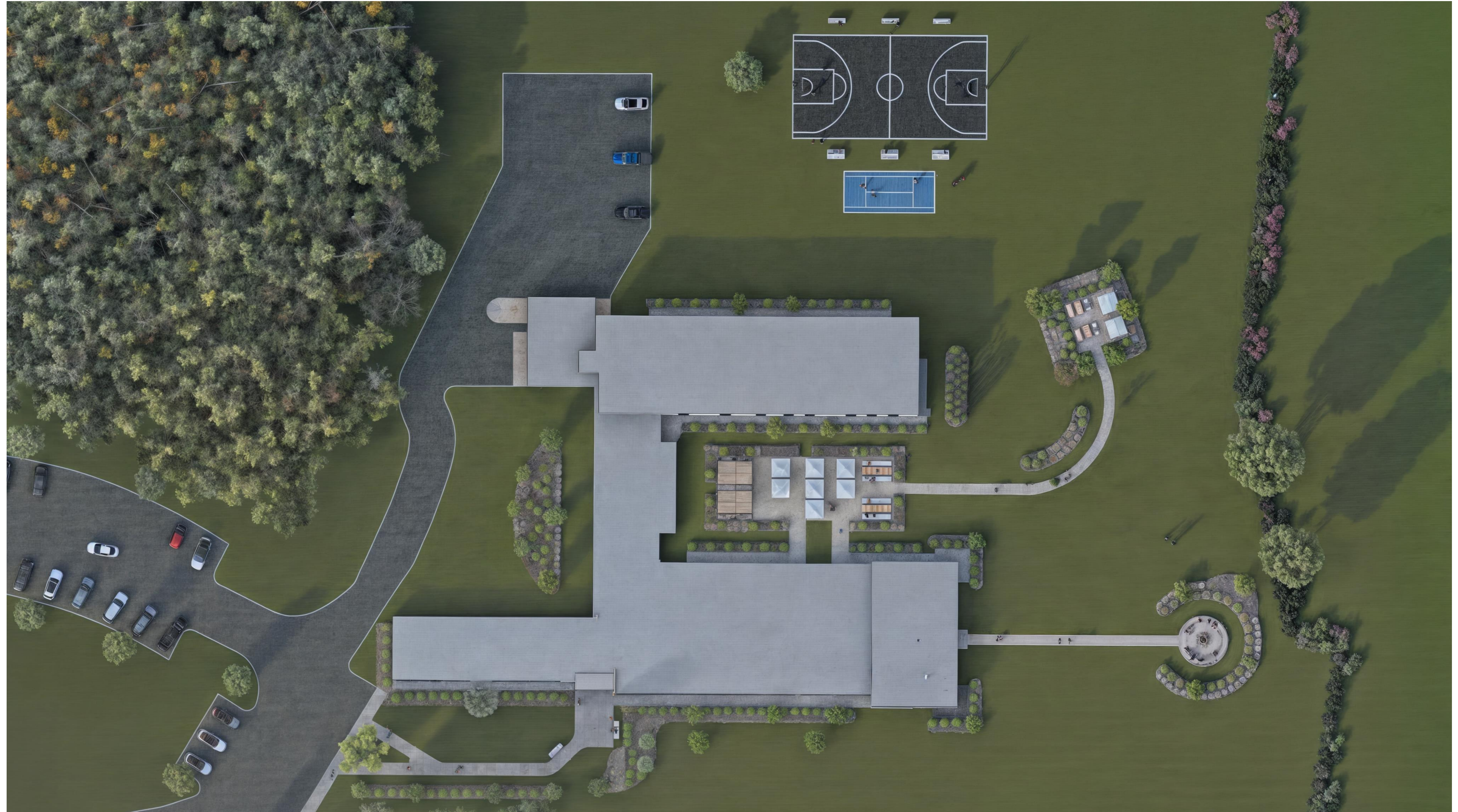
SITE PLAN VIEW